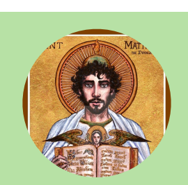
Bible Study Gospel of Matthew June 12 - 10:00AM & 7:00PM