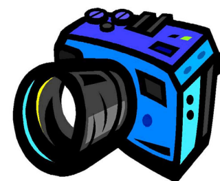
Photo & Announcement Deadline

All that is needed is a small FM pocket radio with headphone jack and earphones. Turn in to 88 on the FM dial.