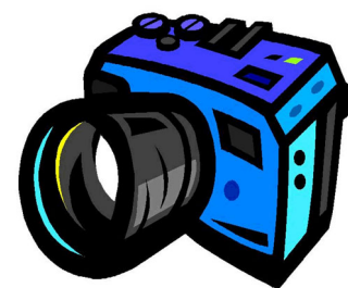
Photo & Announcement Deadline